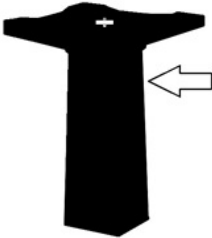
FT-107B (120 lbs) 18"L x 18"W x 25.5"H

Assemble your fountain on a level surface capable of holding a minimum of 134 pounds with an approximate 6 square inch footprint.